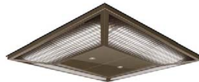
CD299B (P023 / LED Lighting (Daylight) / LED Down Light / Skylight / Anion Air Cleaner)