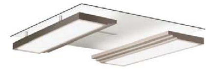
CD597A (P007, Lusterless White / Skylite 10T / Indirect Lighting)