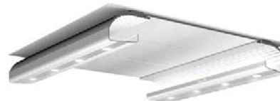
CD519D (Indirect Lighting / Aluminium Silver / Convective Air Sterilization System)