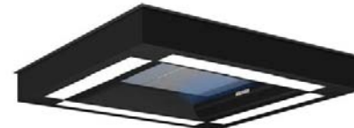
CD251A (P022 / Acryl / Convective Air Sterilization System)