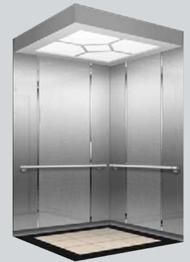
| REAR VIEW |