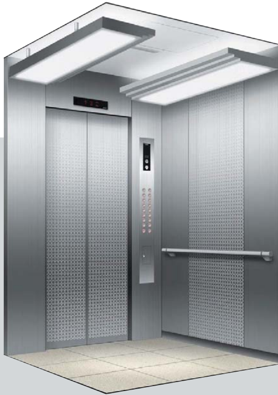
| FRONT VIEW |