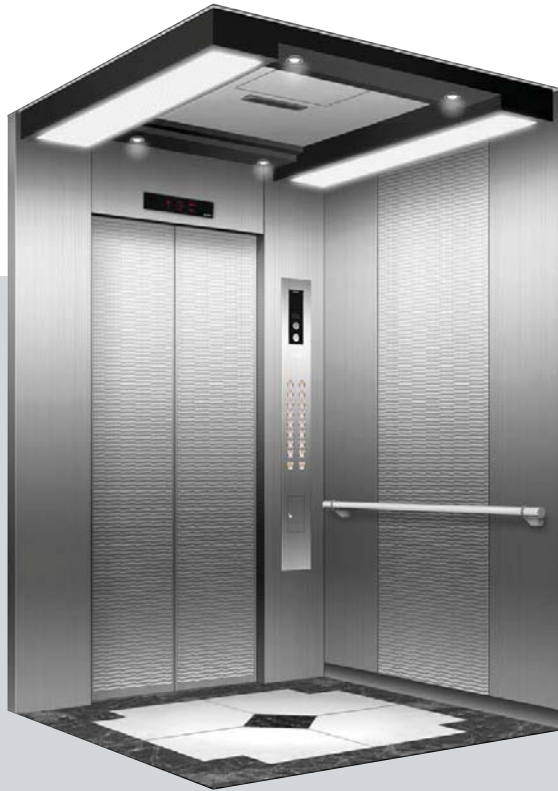
| FRONT VIEW |