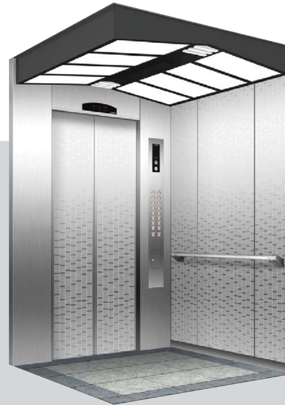
| FRONT VIEW |