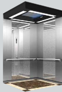
| REAR VIEW |