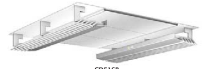
CD516B (Indirect Lighting / Convective Air Sterilization System)