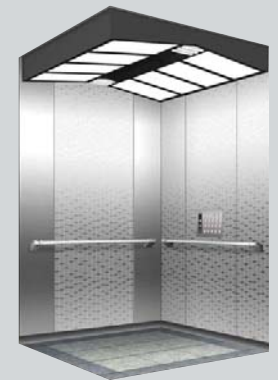
| REAR VIEW |