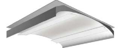
CD569A (Aluminium / Acryl / Sheet / LED Lighting (Daylight) / Anion Air Cleaner)