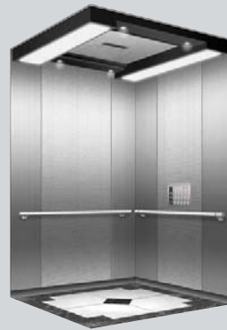
| REAR VIEW |