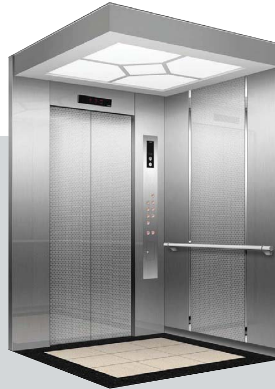
| FRONT VIEW |