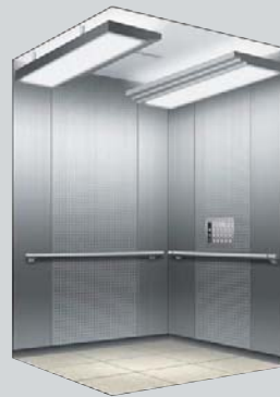
| REAR VIEW |